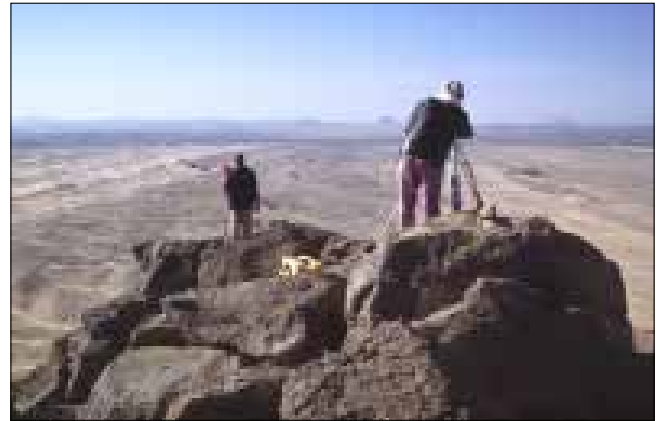
Plate 13. Surveying the hilltop of Jebel Umm Rowag in February 2001.

The other survey focussed on what might be considered the largest archaeological site in the Sudans, the railway begun