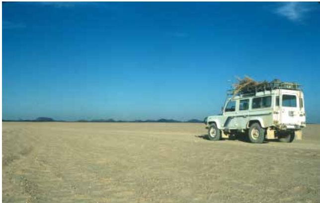
Plate 5. The Landrover 110 County in the Libyan Desert south of Soleh.

Right from the outset the Society made a significant impact to fieldwork in Sudan following its purchase of a Landrover County 110 (Plate 5) which was made available for use during the excavations of the British Institute in Eastern Africa (BIEA) at Soba East on the Blue Nile in December 1992.