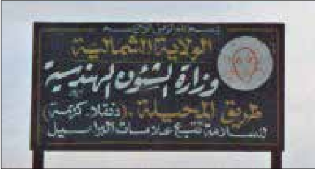
Plate 4. Warning sign at the Dongola end of the Sikkat el-Mabeila – the Road of Death – which cuts across the desert to Kareima.

frequently impossible – now everyone has a mobile phone and internet is widely available. The building of the Merowe Dam in particular has ‘flooded’ riverine Sudan at least to the north of Khartoum with electricity. Generators are largely a thing of the past and the availability of reliable electricity is a particular benefit to research as more and more equipment relies on the regular charging of batteries for laptops, total stations and cameras. The improved road network has also made a much wider range of produce available in the local shops and markets.