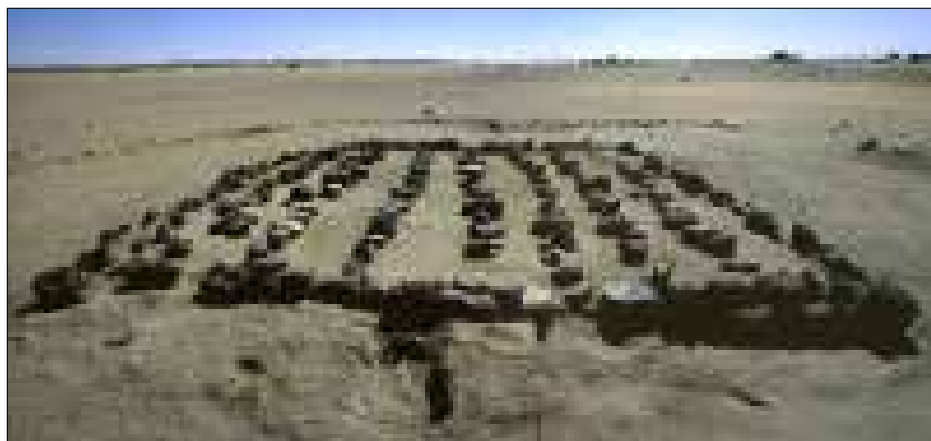
Plate 9. The store building dating to the Kerma Classique (1750-1450 BC) at site P4 in the S.A.R.S Northern Dongola Reach concession.