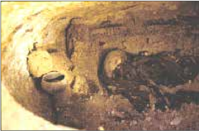
Plate 7. A well preserved Post-Meroitic burial excavated at Gabati in 1994 prior to its destruction by the Challenge Road.

a single season of excavation directed by David Edwards (Edwards 1998; Judd 2012).