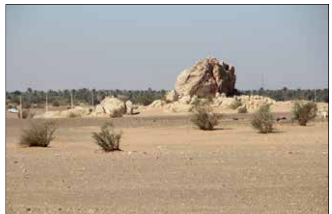
Plate 11. The quartz outcrop at Kurgus on which the inscriptions of pharaohs Thutmose I and III and Ramesses II are carved. It was claimed as the southern boundary of the Egyptian Empire in the New Kingdom.