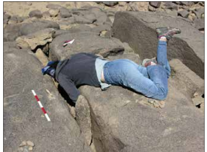
Plate 8. Excavating a crevice grave in the Society's concession at the Fourth Cataract in the winter of 2006-2007.

As noted above, the season had to be postponed but a team was in the field from October to December 1999. When the go-ahead for the dam was finally given in 2002 SARS returned to its concession and fielded multiple teams there until 2007 (Plate 8). The dam was inaugurated in February 2008 and the reservoir was largely full by the end of that year. A vast amount of work was achieved by the Society's field teams with over 2000 sites of all periods being discovered. This has generated a very considerable post-excitation project which the Society, with its very limited funds, is still wrestling with. 1