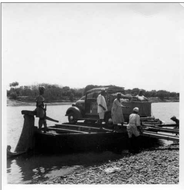
Plate 1. A car ferry on the Nile, 1930s style; an image from the SARS Kirman Archive (KIR P062.02).

The other major change has been the result of widespread development particularly of the transport infrastructure. In 1991 on the east bank of the river the tarmac road extended for a distance of 40km to the north, on the west bank it did not extend outside Omdurman. The Nile could be crossed by bridge in Khartoum but for the next 1,845km along the river's course the only way to get across was by ferry (Plates 1 and 2). Travelling north was a real expedition, the journey to Dongola for example was a 500km trip across the desert along rough tracks, through thick sand and across gravel