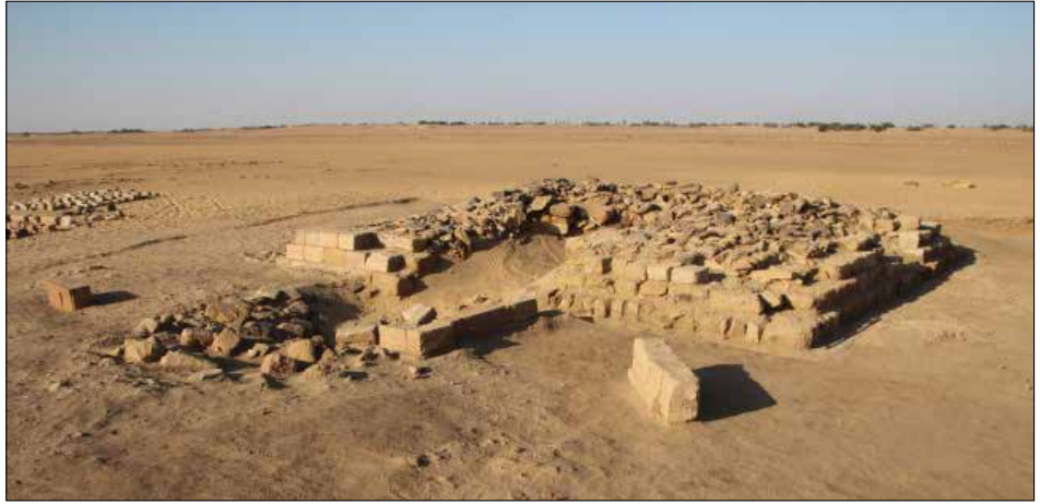
Plate 10. One of the six dressed sandstone pyramids excavated within the Society's concession at Kawa in recent years.

This work has been followed by detailed excavations at Kawa, the main urban centre in the region during the Pharaonic and Kushite periods. Following on from the excavations of the Oxford Excavation Committee in 1929-31 and 1935-6 work has taken place in a number of areas across the town with differing functions – the gateway into the temenos, a store building with palatial