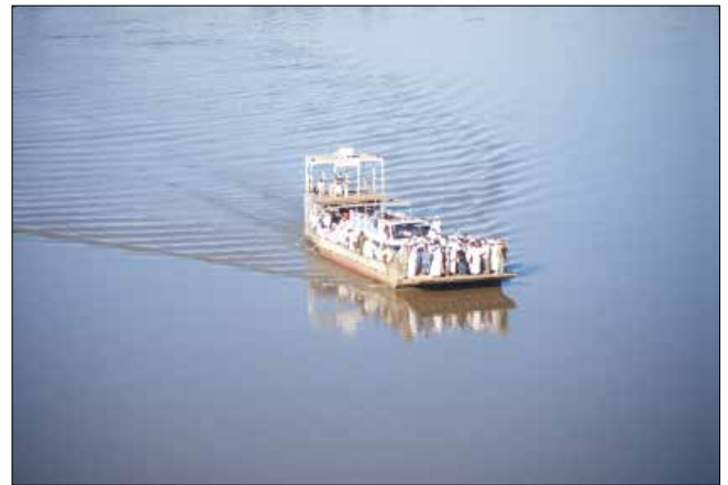
Plate 2. A ferry crossing the Nile to Merowe in 2003.

plains (Plate 3). Sign posts were non-existent. The route was once described thus – “coming out of Omdurman head just to the left of the hills you see to the north west, drive for about 5 hours then make sure not to take the track veering off to the right. After another 6 hours going more or less north turn sharply to the east and you will hit the river at Dongola”. Fuel could be obtained in Khartoum – the next fuel stop was in Dongola. Crossing the river was a time consuming