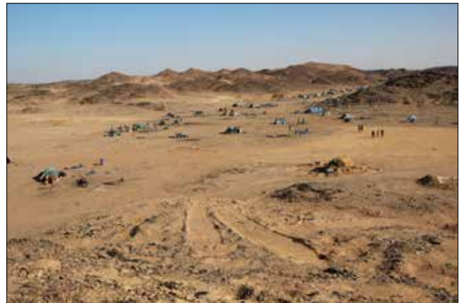
Plate 6. Gold miners' encampment at Umm Nabarti (Nabardi), a site mined during the New Kingdom and by an Anglo-Sudanese company in the early 20 th century when approximately 250,000 ounces of gold were extracted.

The main threats to archaeology over the last 25 years have come from massive infrastructure projects – roads and dams – although the expansion of settlements and farming activities are also significant. A very new phenomenon is the current gold rush (Plate 6).