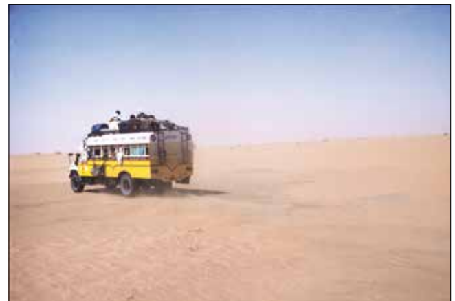
Plate 3. The Khartoum to Dongola bus on the 'main road' across the Bayuda in 1983.

plains (Plate 3). Sign posts were non-existent. The route was once described thus – “coming out of Omdurman head just to the left of the hills you see to the north west, drive for about 5 hours then make sure not to take the track veering off to the right. After another 6 hours going more or less north turn sharply to the east and you will hit the river at Dongola”. Fuel could be obtained in Khartoum – the next fuel stop was in Dongola. Crossing the river was a time consuming