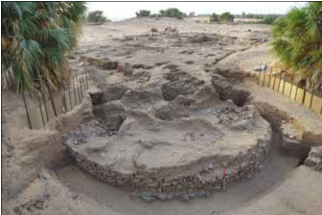
Plate 12. The massive projecting south-east angle tower under excavation in 2015 at Kurgus.

In the wake of the Egyptian Epigraphy Projects' activities at Kurgus SARS has now focused its field activities in the area undertaking extensive excavations within the fort and in cemetery KRG3 (Ginns 2015; Haddow 2014; Nicholas 2014). This is planned initially as a five season project. In the three seasons to date much of the defensive circuit of the fort comprising walls 5m thick, boldly projecting circular angle towers (Plate 12) and rectangular interval towers have been uncovered. Excavations have now moved to the fort interior