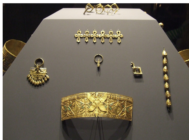
Figure 6. Arrangement of Ant. 2497 in the Staatliches Museum Ägyptischer Kunst, München.