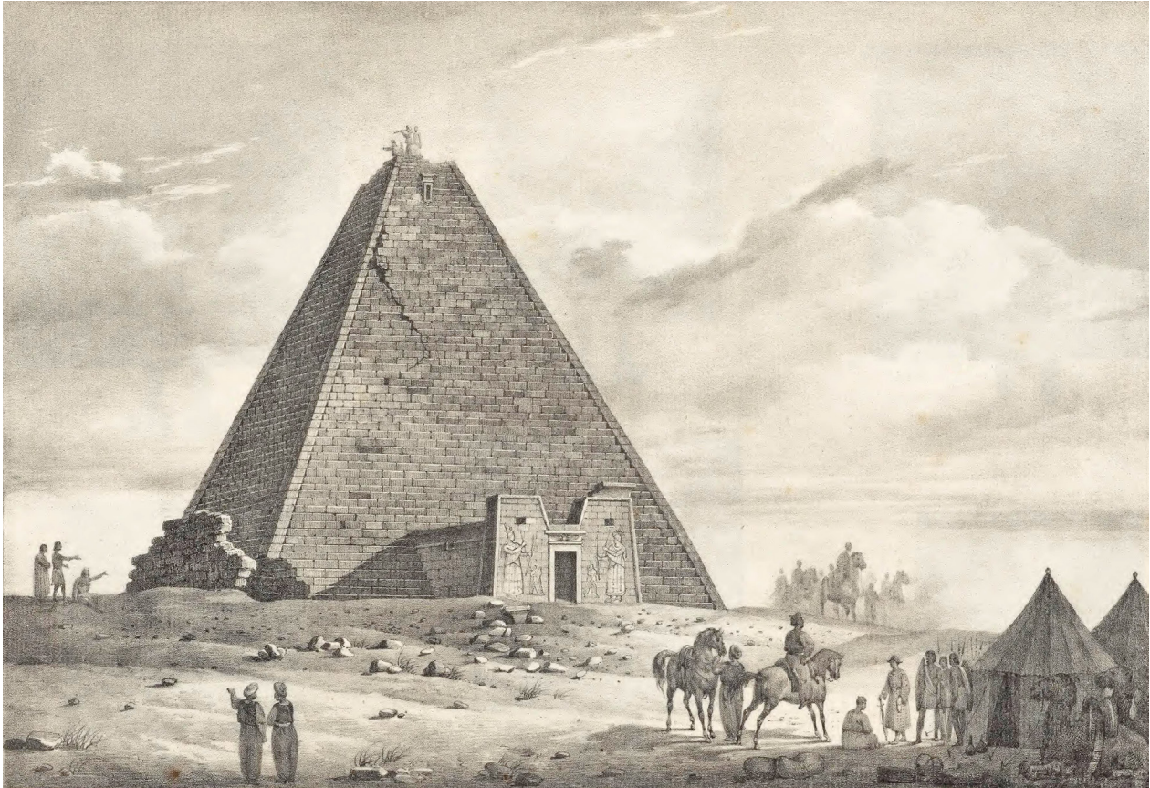
Figure 2. Pyramid Beg. N. 6 as seen in 1821 (Cailliaud 1823, pl. XLI).