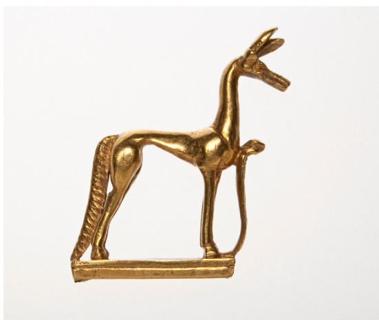
Figure 5. Ant. 2497 (© Staatliches Museum Ägyptischer Kunst, München, photograph by M. Franke).

So none of these publications gives a clue as to the true origin of EA68502, but only presents current assumptions without discerning the way that the jackal got to London. However, it was overlooked that an explanation can be found in a letter written by John Gage Rokewode (Director of the Society of Antiquaries of London from 1829 until 1842 and Fellow of the Royal Society since 1824) to the Society's Secretary, Sir Henry Ellis, dated 30 th April 1840 on the occasion of an exhibition of some gold ornaments found at Meroe. The complete letter was published by Rokewode (1840, 386f.), and also referred to in his obituary (Lucas 1842, 660). The relevant extracts read: