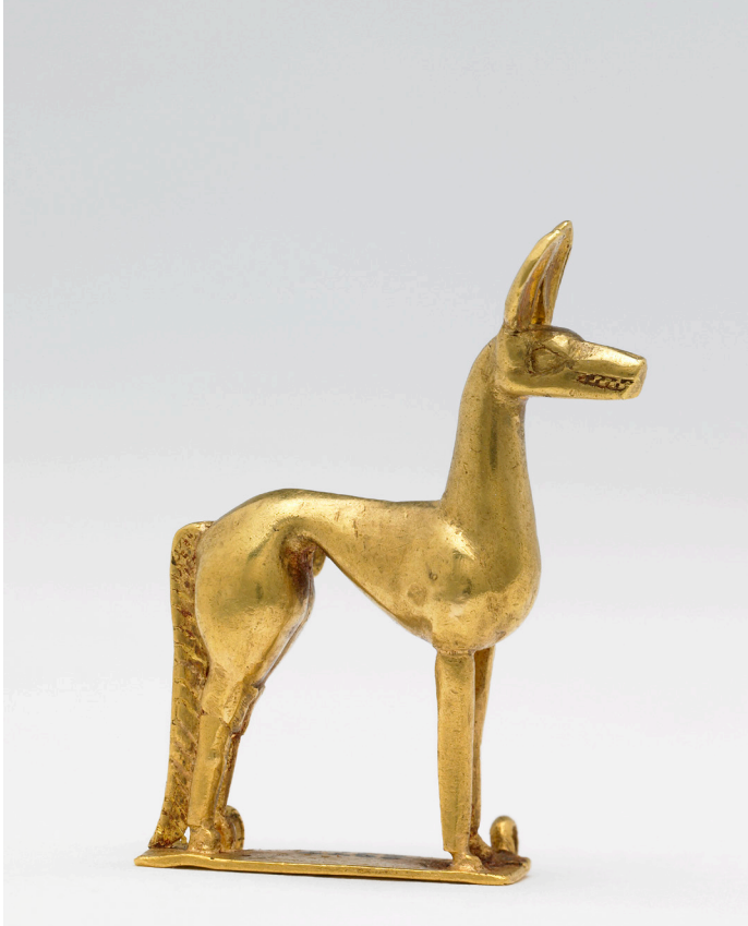
Figure 1. EA68502 (reproduced © The Trustees of the British Museum).

The British Museum houses a splendid piece of Meroitic jewellery: a gold pendant in the form of a jackal standing on a horizontal base with four suspension loops attached to its left side (EA68502; Figure 1). This object has aroused attention since the 1970s, as according to documentation in the museum's records it originated from modern-day Libyan Cyrene and has therefore been the subject of speculation regarding Meroe's role in foreign trade and its impact on neighbouring regions (Wenig 1978, 247 cat. 176; Taylor 1991, 56, ill. 73).