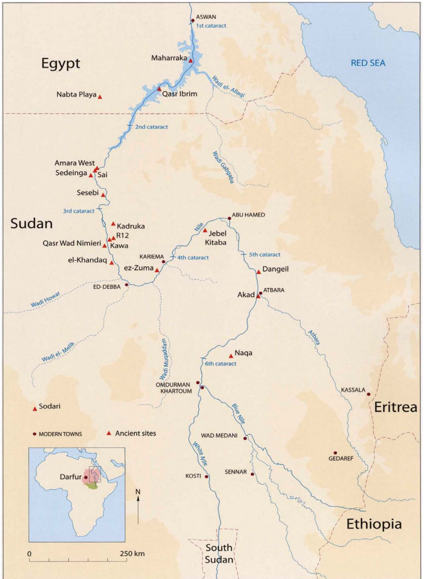
The map reflects the new territorial situation following the independence of South Sudan in July 2011.