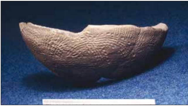
Plate 19. An almost complete pot from the site of Aneibis located along the main Nile. The pot is decorated with a typical wavy line pattern.

to process plants as well as wild fauna. This might indicate that the diet of the inhabitants consisted of porridge/beer as well as meat.