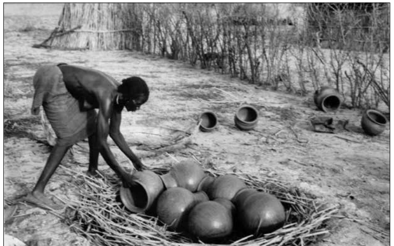
Plate 13. A small depression in the ground lined with straw and bark where pots are stacked ready to be fired, from the village of Gidad.

on grinders to remove impurities (Plate 10). The first step in shaping the pot is to work the clay into a ball (Plate 11). The potter makes a small depression in the ground. Above this she places the clay, and pounds the clay ball into shape with an anvil of dry clay. This creates the round bottom of the pot. She will pound the pot into shape with the same anvil and lastly put on the neck (Plate 12). The pots are decorated with simple incised designs, and then left to dry in the sun; pots are smoothed or burnished usually with a water-rolled pebble before being fired. The firing of the pots takes place just outside the village and is a very simple technique using a small pit in the ground into which the pots are placed. The fuel consists of grass and bark which are placed beneath and above