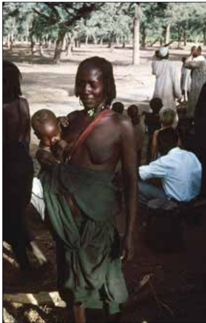
Plate 2. A woman from the village of Zalingei breast feeding her baby.

husbands cultivated their own separate fields and stored the grain in their own separate granaries. The husband did not have rights in his wife's granary. There seemed to be a near equal workload among husbands and wives in cultivation activities. However, by being with the women in the village I was struck by the observation that women were busy all the time – they were nurturing children, they were weeding, husking, winnowing and grinding grain, they were fetching water (Plate 4) and cutting firewood, they were sweeping the hut and the compound, they were boiling porridge and brewing beer. At 4-5am while still dark I often woke to the sound