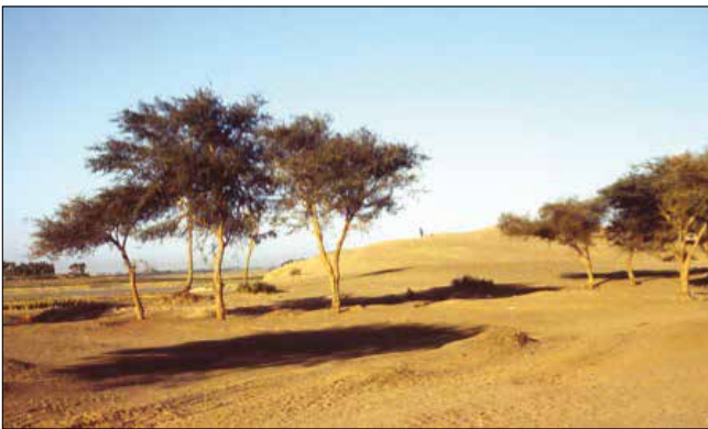
Plate 18. The Abu Darbein site is situated along an old bank of the river Atbara. This sort of location is typical for the Mesolithic sites in the area.

pottery was becoming quite abundant. I believe that it is a good illustration of the development of a multi-resource and aquatic adaptation of people when the use of pottery had become quite diversified.