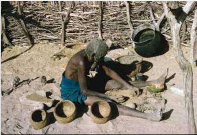
Plate 10. A Fur woman from the village of Toumra making pots. Note the broken grinder in the back, used for pounding and grinding the clay to get rid of impurities.