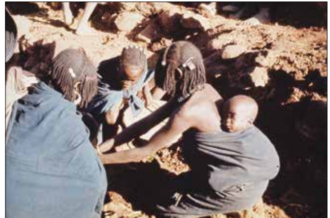
Plate 7. Fur women from Jebel Marra collecting ants from underground nests.

Since I was puzzled by the lack of evidence on our archaeological sites of domesticated cereals such as sorghum I wanted to get some information on exploitation of wild plants by gathering and simple cultivation activities. During fieldwork (1973) in the village of Toumra in northern Darfur I observed