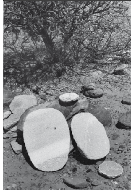
Plate 9. A sample of roughly pecked upper and lower grinders at the quarry.

Since I was rather puzzled by the large numbers of grinders that we had excavated on the Nile Valley sites, I undertook fieldwork in 1978 in the village of Dor in northern Darfur. Women in the village were making their own grinding stones. Suitable raw material was found in only one area, where a fine-grained sandstone was located. Women had their own quarry where they extracted the raw material and did the rough shaping of the grinders (Plates 8 and 9). The grinders were then