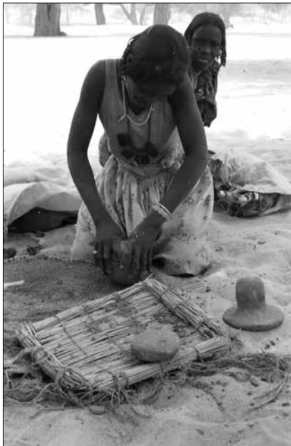
Plate 11. Fur women from the village of Gidad kneading the clay into a ball pot. Note the clay anvil in the front which will be used to beat the pot into shape.