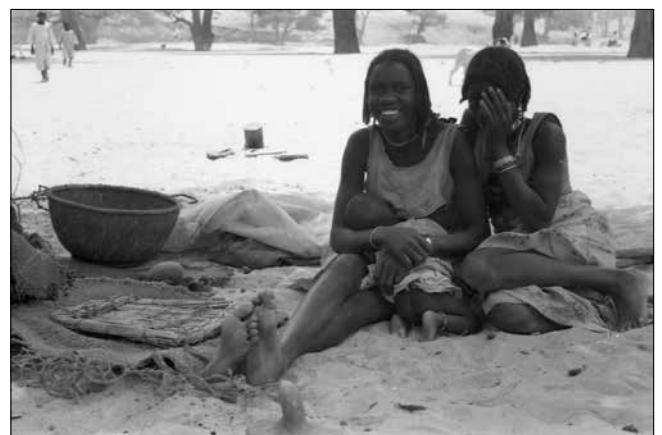
Plate 14. While making pots, women will bring their babies along. Here a woman from the village of Gidad is breast feeding her baby in a break from her chores.

the pots (Plate 13). From lighting the fire, it takes less than an hour to finish the process. When women are making pots they will bring their babies along for breast feeding (Plate 14).