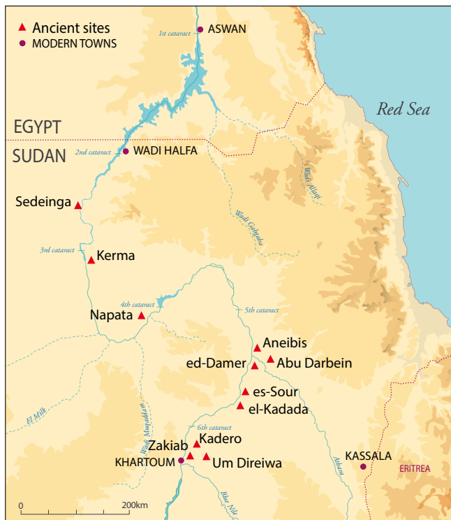
Figure 1. Map of Neolithic sites along the Nile discussed in the text.