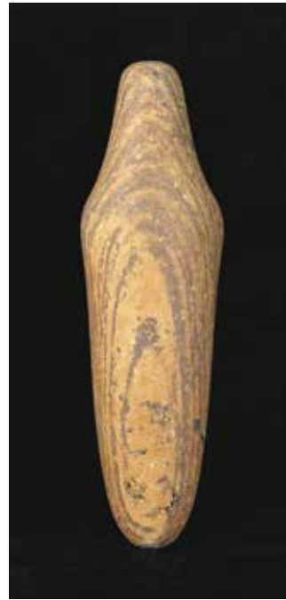
Plate 16. Stylized sandstone figurine (SNM 26861) from Kadruka. The figurine was recovered in a very rich male grave dated to c. 4000 BC. The burial objects included, bucrania, nine mace heads, a diorite palette, several ivory bracelets, and pottery such as caliciform vessels and goblets.

The ethnographic insight stimulated me to search for evidence backwards in time in order to explore possible connections between the early emergence of pottery making and women's work.