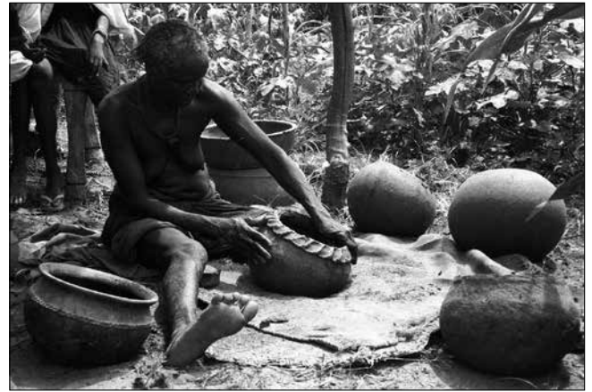
Plate 12. A potter from the village of Sarar putting on the neck of the pot after having finished shaping the rounded body.