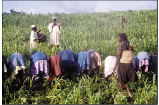
Plate 3. Women weeding sorghum. Note the baby strapped to the back of one woman.

husbands cultivated their own separate fields and stored the grain in their own separate granaries. The husband did not have rights in his wife's granary. There seemed to be a near equal workload among husbands and wives in cultivation activities. However, by being with the women in the village I was struck by the observation that women were busy all the time – they were nurturing children, they were weeding, husking, winnowing and grinding grain, they were fetching water (Plate 4) and cutting firewood, they were sweeping the hut and the compound, they were boiling porridge and brewing beer. At 4-5am while still dark I often woke to the sound