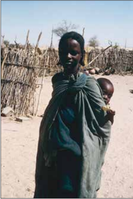
Plate 1. A young Fur woman from the village of Kuttum with a baby strapped to her back.