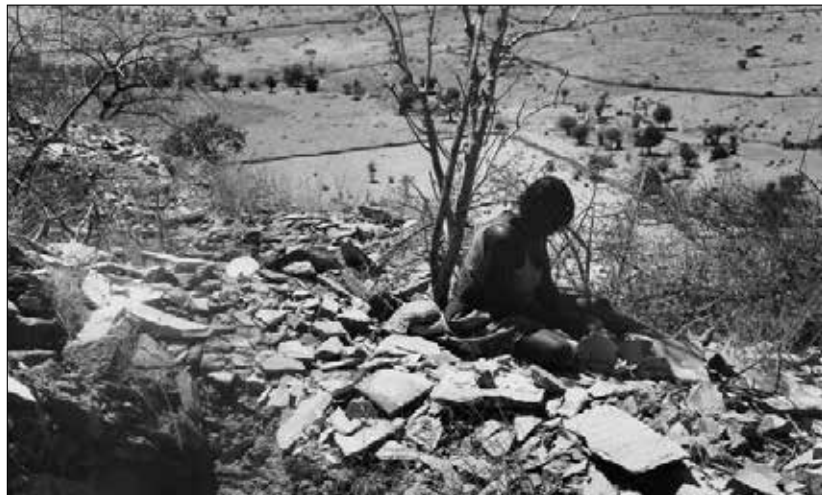
Plate 8. A woman from the Village of Dor pecking the grinders into a rough shape at the stone quarry before bringing them back to the village at the foot of the hill.

brought back from the quarry to the village where the final shaping and pecking of the tools took place. I studied their use over time and discovered that the surface of the grinders gradually became too smooth and had to be re-textured with a hammer-stone made of fine-grained quartz. The process of re-texturing had to be repeated every 3-4 weeks. These