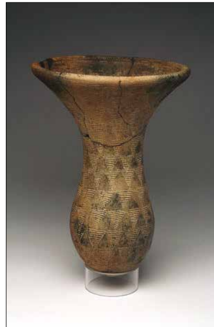
Plate 5. Caliciform beaker from Kadero.

of two cemeteries. The burial ground on the outskirts of the site showed differences in grave location related to sex and age. Some graves had a very rich inventory of grave goods consisting of several mace-heads, a varied collection of ceramics including beautiful caliciform beakers (Plate 5), fine personal ornaments including different types of beads made from carnelian, shells traded from the distant Red Sea, ivory bracelets, lip plugs, nose and ear plugs. There were several finds of bucrania suggesting the ritual importance of cattle.