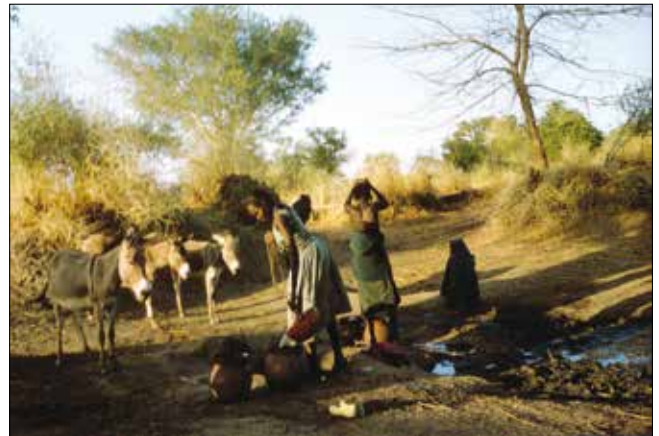
Plate 4. Women from the village of Amballa fetching water. Note the baby strapped to the back of the woman.

of sorghum being ground – this female activity went on for 2-3 hours before other tasks had to be undertaken. Grinding is an activity that gradually wears down the body. I later discovered that material from Neolithic sites in the Levant indicated that female skeletons had traces of heavy wear on knees and ankles related to these activities (Akkermans and Schwartz 2003). These daily chores seemed to be somehow taken as a 'natural' condition of being a woman (by the Fur as well as by the anthropologists). It is just these seemingly trivial activities I shall focus on here. I shall suggest that they produced incremental changes that over time had revolutionary social consequences.