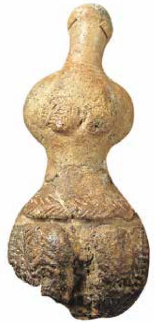
Plate 17. Clay figurine (SNM 26895) from el-Kadada dated to the mid fourth millennium BC recovered from a grave of a child; it was placed by the neck of the child, breasts and pelvis are outlined, incised pattern around the breasts and stomach-pelvis might be tattoos. (photo: Rocco Ricci, © Sudan National Museum).