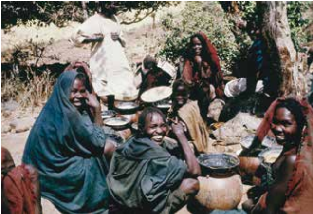
Plate 15. Fur women selling beer in the market. The act of selling beer is considered immoral like selling sex.

One important item found in early Neolithic communities that I interpret as related to mother-child based solidarity consists of figurines modelled on attributes of the female body. However, among the Muslim Fur I found no evidence of this kind of symbolic imagery.