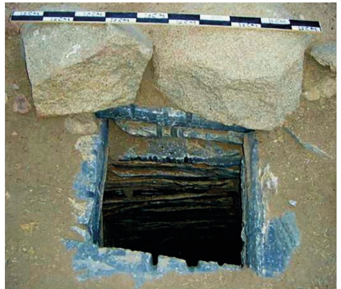
Figure 13. A well, built of black stone near the Safya site in the Butana area.