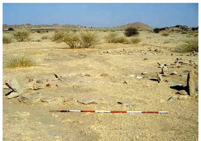
Figure 17. Islamic tombs at the Jebel el-Hambra site.