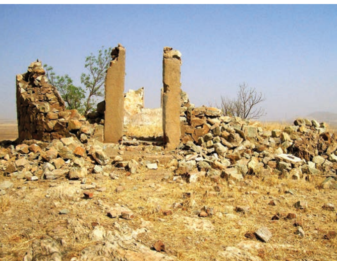
Figure 28. Tower at the mountain of Gala el-Nahal, South Gadarif area.