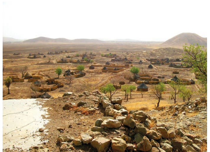
Figure 29. View from the tower at the mountain of Gala el-Nahal, South Gadarif area.