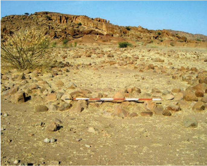
Figure 30. Structure of Tabiyat Abu-Qlout, eastern area.