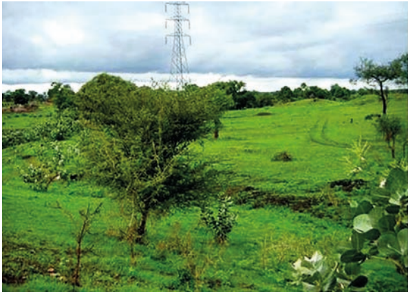
Figure 3. Flood zones in Gadarif.