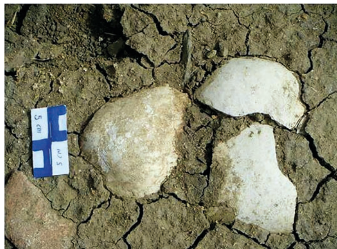
Figure 34. Remains of a human skull exposed as a result of the excavation of a water basin in the Umm Ruweishd village in the Butana area.