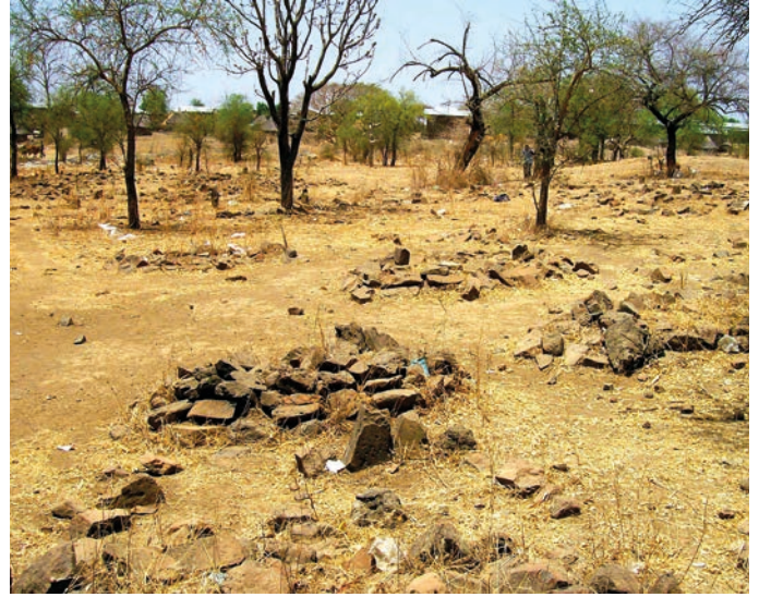
Figure 31. Ja'aleen cemetery at al-Mutamah in Ethiopia.