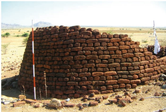
Figure 14. Dome-shaped structure of red bricks at Sheikh Baspar.