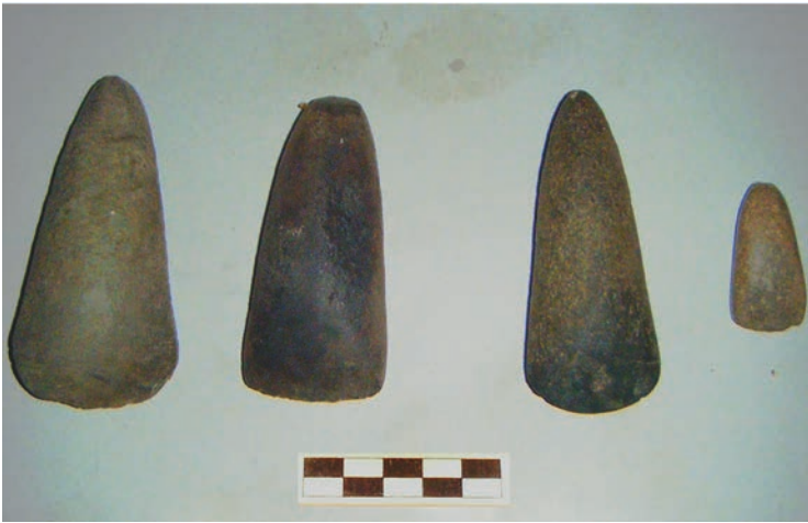
Figure 6. Basalt hand axes from Galbi in southern Gadarif.