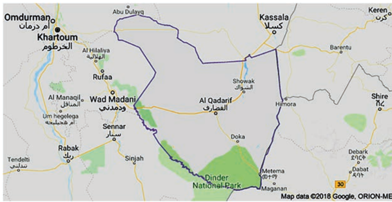
Figure 1. Map of Gadarif.