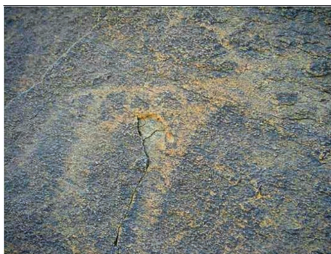
Figures 20 and 21. Some of the abundant petroglyphs at the mountain of Suki el-Sadgab.