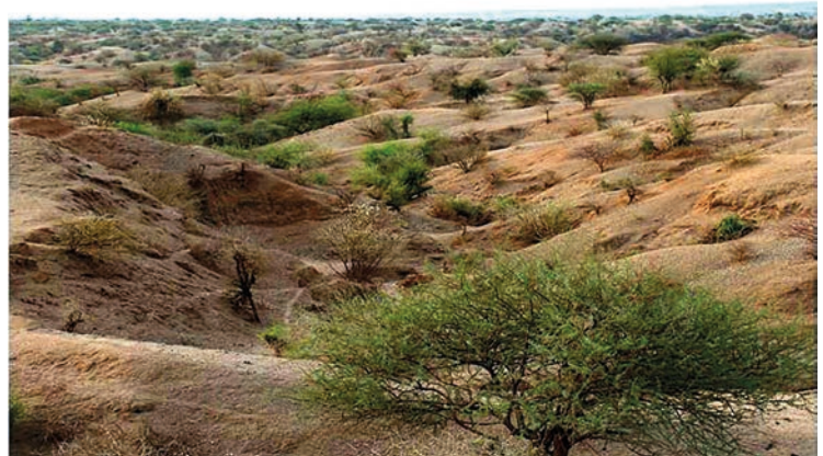
Figure 4. General view showing the 'Karab' phenomenon.

region. These sites require dedicated, systematic archaeological study (Crowfoot 1920, 85-92).