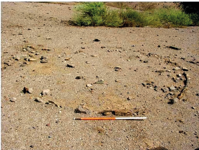
Figure 26. Remains of a settlement at Khor Abu Gara.