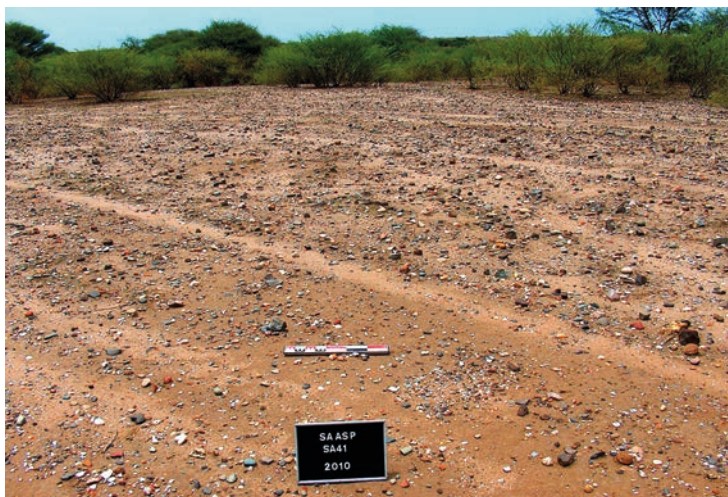
Figure 10. Saworta Site 41 in the Fashaga area.