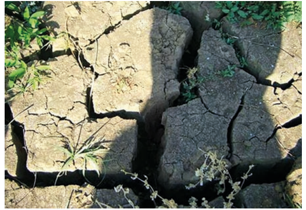
Figure 2. Mud flats in Gadarif.