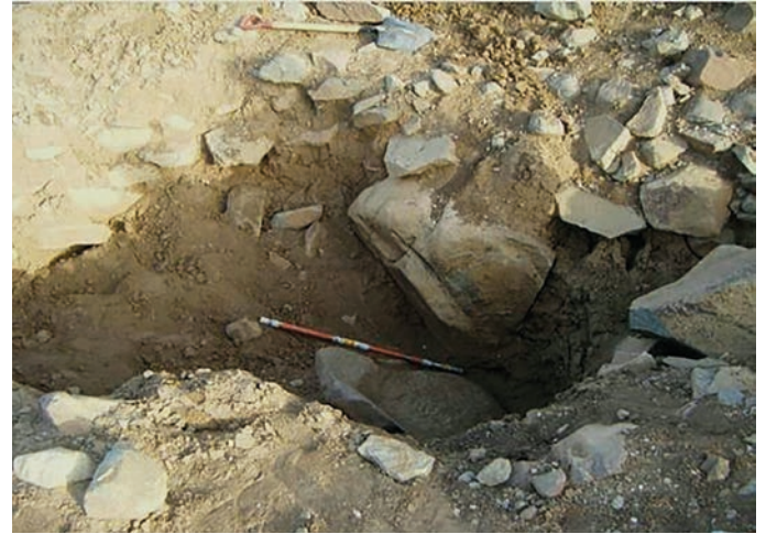
Figure 33. Destruction by gold-diggers at the site of al-Hagar in the Butana area.