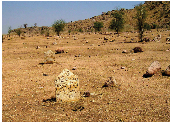
Figure 27. Mahdist tombs in Ban al-Sayed Ali.