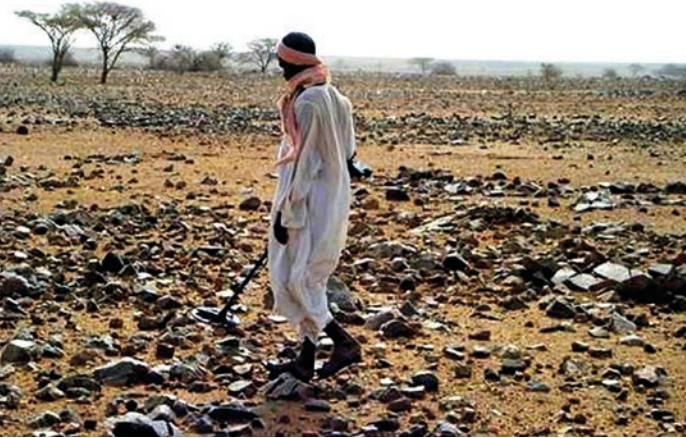
Figure 32. Detection of gold by metal detector at the site of Wad Bishara in the Butana area.