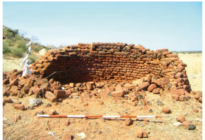
Figure 15. Dome-shaped structure of red bricks at Sheikh Baspar.