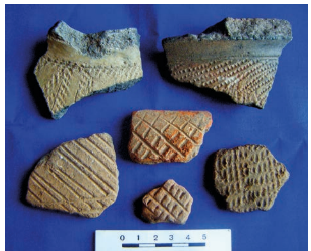
Figure 11. Pottery fragments from the site of Jebel Kasmor.