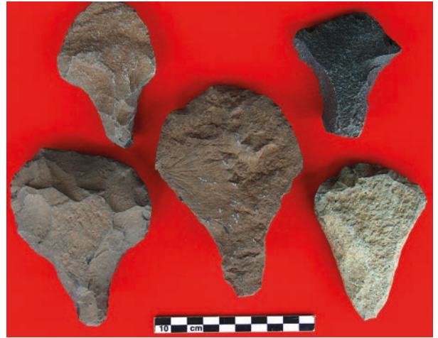
Figure 7. Stone hand-axes from the surface of Site 41 in the Fashaga area.