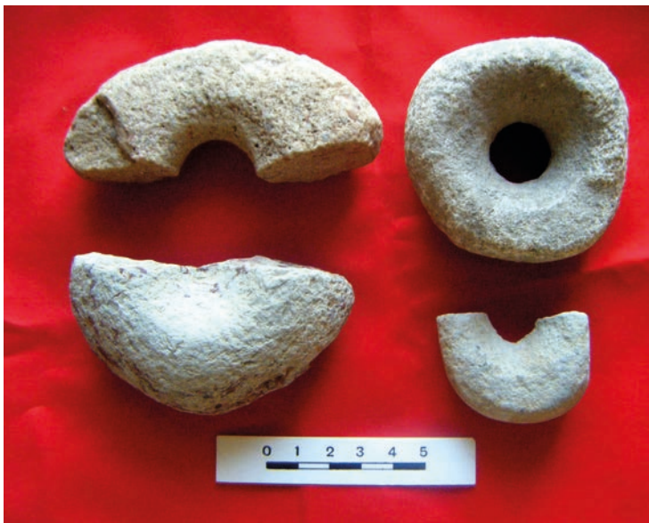
Figure 8. Stone tools from Kasmor site in northern Gadarif.