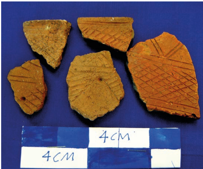
Figure 12. Decorated pottery from Wad el-Ammas.