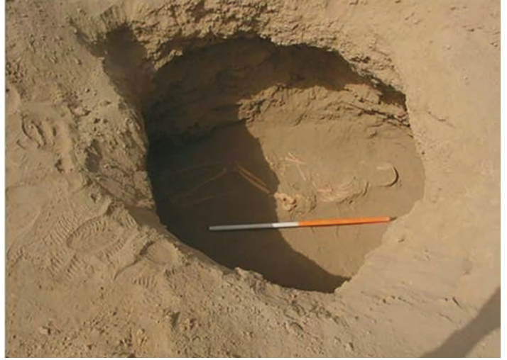
Figure 25. Test pit showing the burial in one of the tombs at the site of Shenqayra.