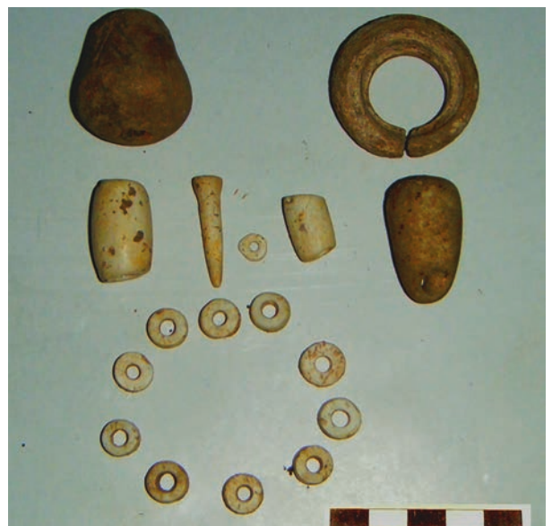
Figure 9. Ornaments made of ostrich eggshell and ivory from Galbi in southern Gadarif.