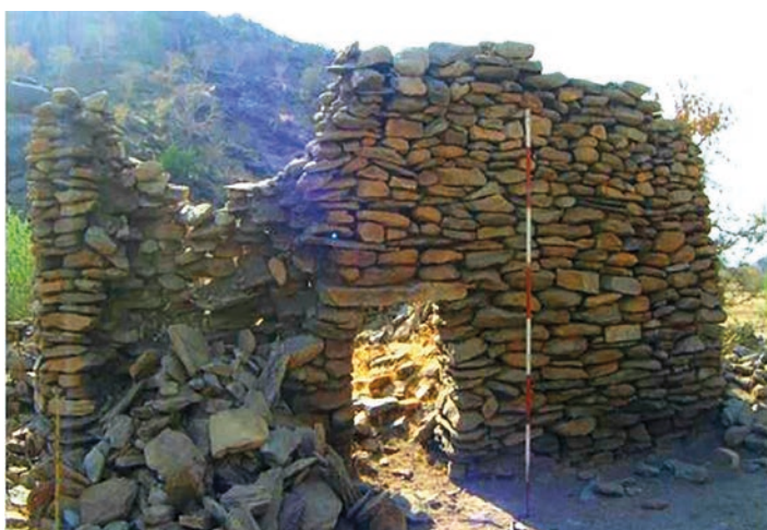
Figure 16. Building for Sheikh el-Tayeb in Suki el-Sadgab village.