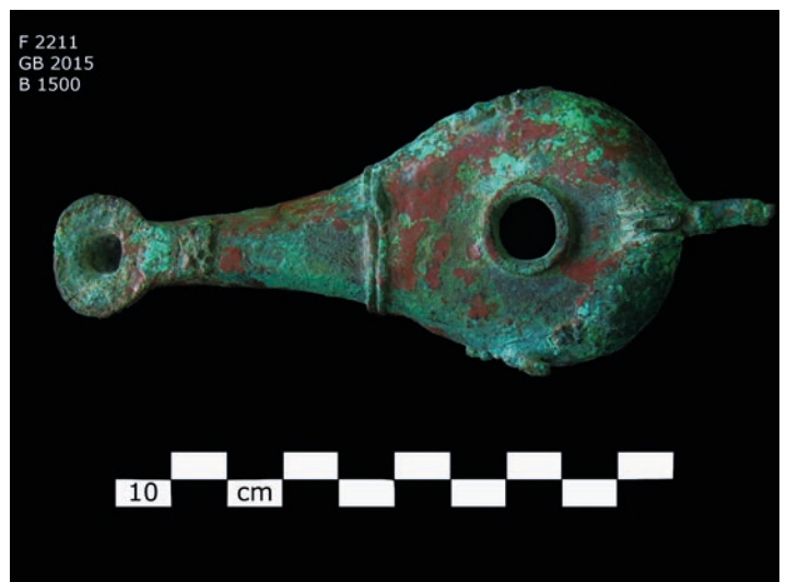
Figure 6. Scale photo of the lamp.