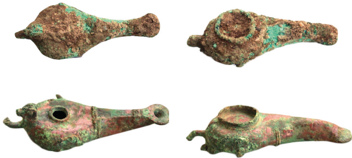
Figure 4. The lamp before and after restoration (photograph Silvia Zauner-Mayerhofer).

It has been suggested that copper was present in Nubia in the areas of Tombos and Kerma; in the latter, particularly, a bronze-maker's workshop dating from the Middle Kerma period was found, mainly used for the production of knives and daggers (Bonnet 1986, 19-21).