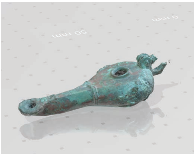
Figure 5. 3D model of the lamp after restoration (illustration Silvia Callegher).

Among the most complex decorative motifs of bronze objects known from Meroitic contexts, there are the famous centaur and horse adorning the handles of the lamps of Queen Amanikhatashan. These two bronze lamps, found in the Northern Cemetery of Meroe and ascribed to Amanikhatashan (Welsby 1996, 174-175), Queen of Kush, could be items of comparison for us. In common with the Jebel Barkal lamp, both Meroe lamps are characterised by a flat top surface and one round spout. The one decorated with a centaur, today displayed in the Sudan National Museum, also has a ring base and both have been found in a context dated to the 1 st century AD. The handles of the two lamps from Meroe, unlike the lamp from the Palace of Natakamani, are fully preserved and end with elaborate decorations. The handle of our lamp, even if broken, appears to have been likewise ring-shaped.