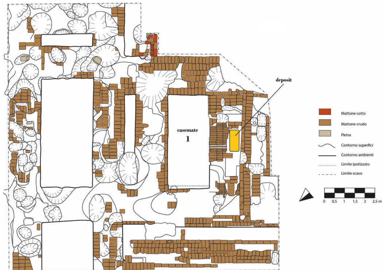
Figure 2. Southwest corner of Palace B1500 (map Alice Salvador).

The subject of this study is a bronze oil lamp (Iannarilli 2019, 93-94), closed-shape, characterised by an oval body in the middle of which is a hole for the introduction of oil. This hole is surrounded by a disc. It is not unusual, especially