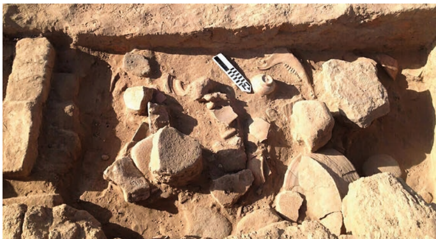
Figure 3. Deposit where the lamp was found.

the broken handle; the whole surface, however, presented a patina due to oxidation – partially maintained – and signs of metal corrosion due to the deposition conditions (especially soil and Nile water, the flooding of which reached the archaeological area until recently. The last great flood occurred in 1988, devastating part of the city of Karima and the archaeological site of Jebel Barkal). The lamp was, therefore, subjected by the restorer Silvia Zauner-Mayerhofer to an extremely laborious mechanical cleaning procedure, which today allows for a better appreciation of the shape and details, while ensuring the preservation of the original surface (Figure 4).