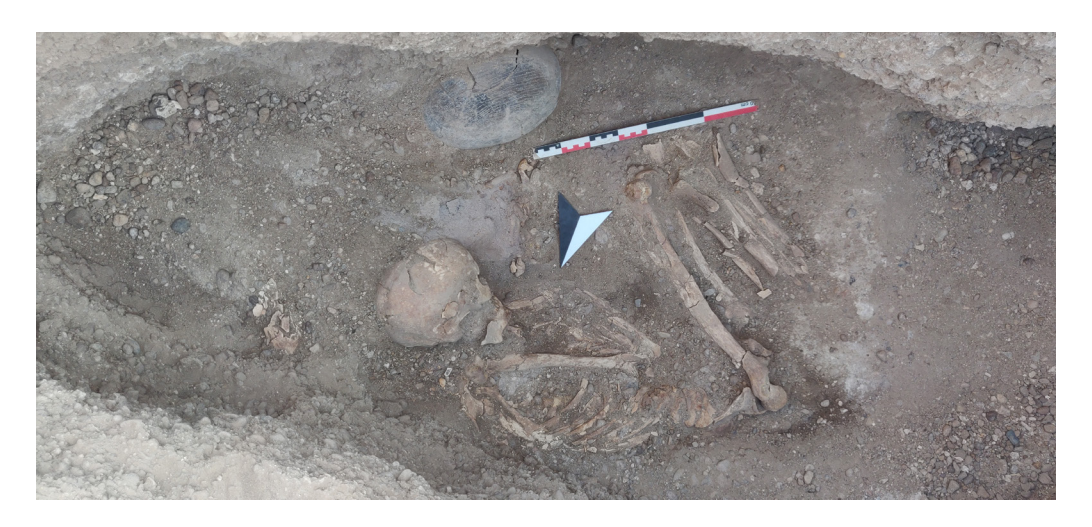
Figure 13. Skeleton in Tomb 4 at Artoli.