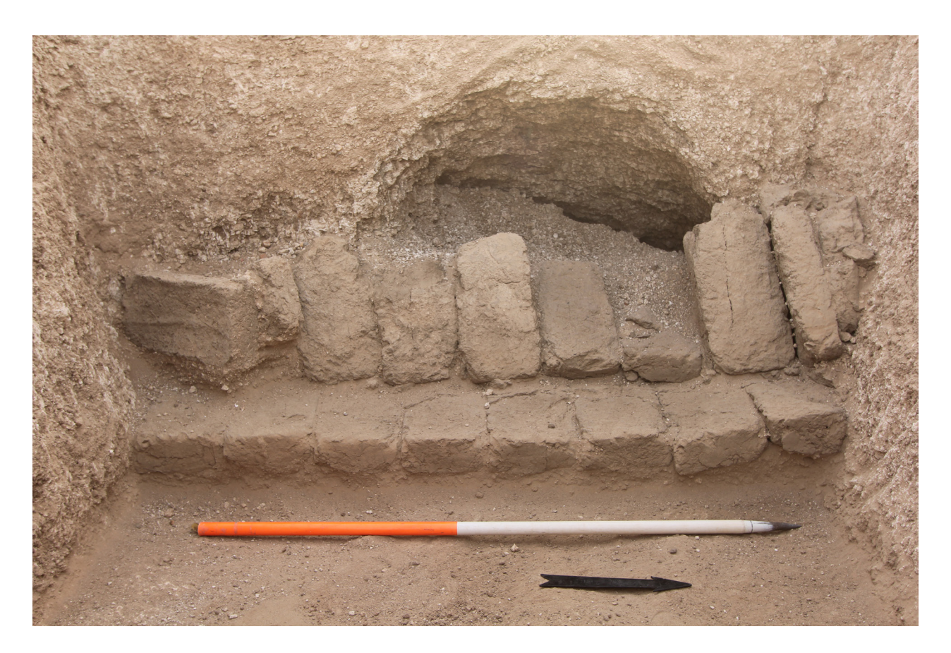
Figure 8. Blockage in BMC 63.