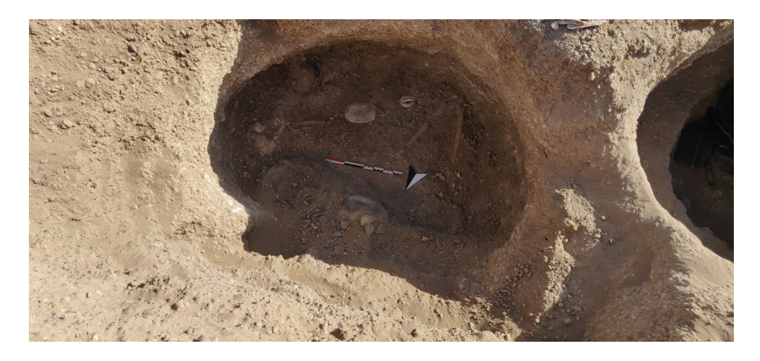
Figure 15. The lower burial in Tomb 5 at Artoli shows a rich funerary assemblage.