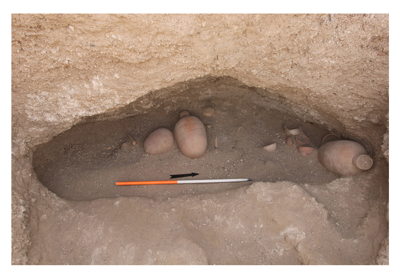
Figure 4. Funerary assemblage in the burial chamber of BMC 61.