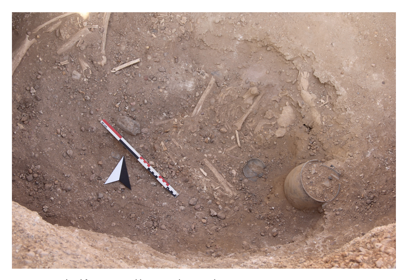
Figure 16. Burial and funerary assemblage in Tomb 6 at Artoli.

Excavations in the recently discovered Kushite cemeteries in Berber, el-Fereikha, Enapis, and Artoli in the region of Berber above the Fifth Cataract reveal the potential of the area for new research. To date, archaeology in the area has mainly been associated with the Meroitic period, but the newly discovered sites provide evidence for an earlier Kushite presence dated to the Napatan and perhaps even Kerma periods. The existence of different cemeteries over a distance of c. 50km along the east bank of the Nile presents an opportunity to gain further understanding of Kushite society and its presence in the region. The burial traditions in the cemeteries at Berber, el-Fereikha, Enapis, and Artoli show similarities and