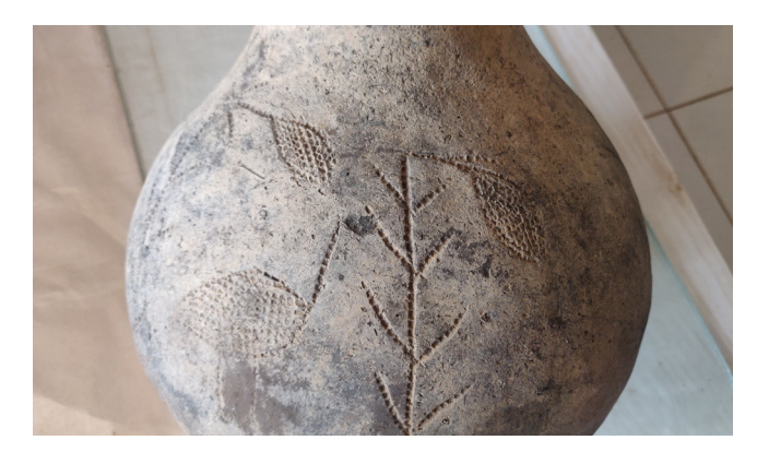
Figure 3 a, b. Pottery jar with decoration of sorghum heads from BMC 60.

The funerary assemblage shows this was a rich tomb. There were five pottery jars of different size and type. Among these is one black handmade jar with a clear impressed decoration of sorghum heads on the belly (Figure 3 a, b). This jar provides additional support for the important role of sorghum in the region of Berber (Edwards 2014; Mahmoud Suliman Bashir 2013, 99).