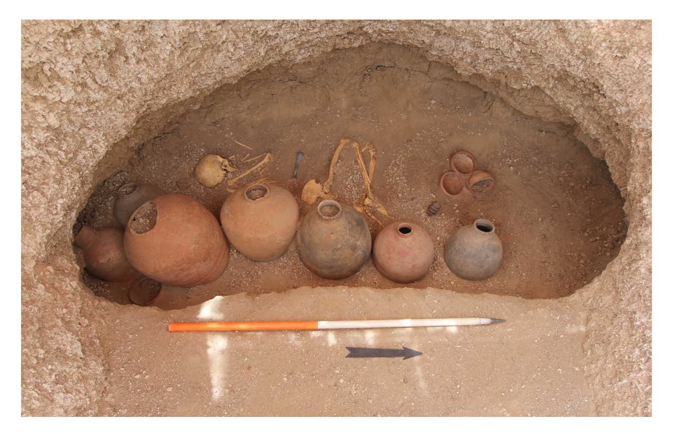
Figure 9. Rich funerary assemblage in BMC 63.

Kerma period. Our visit to the newly discovered site provided further information demonstrating the archaeological richness of the area, despite it being partially damaged by local farmers' activities.