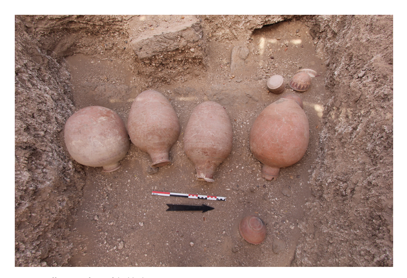
Figure 5. Offerings in front of the blockage in BMC 62.