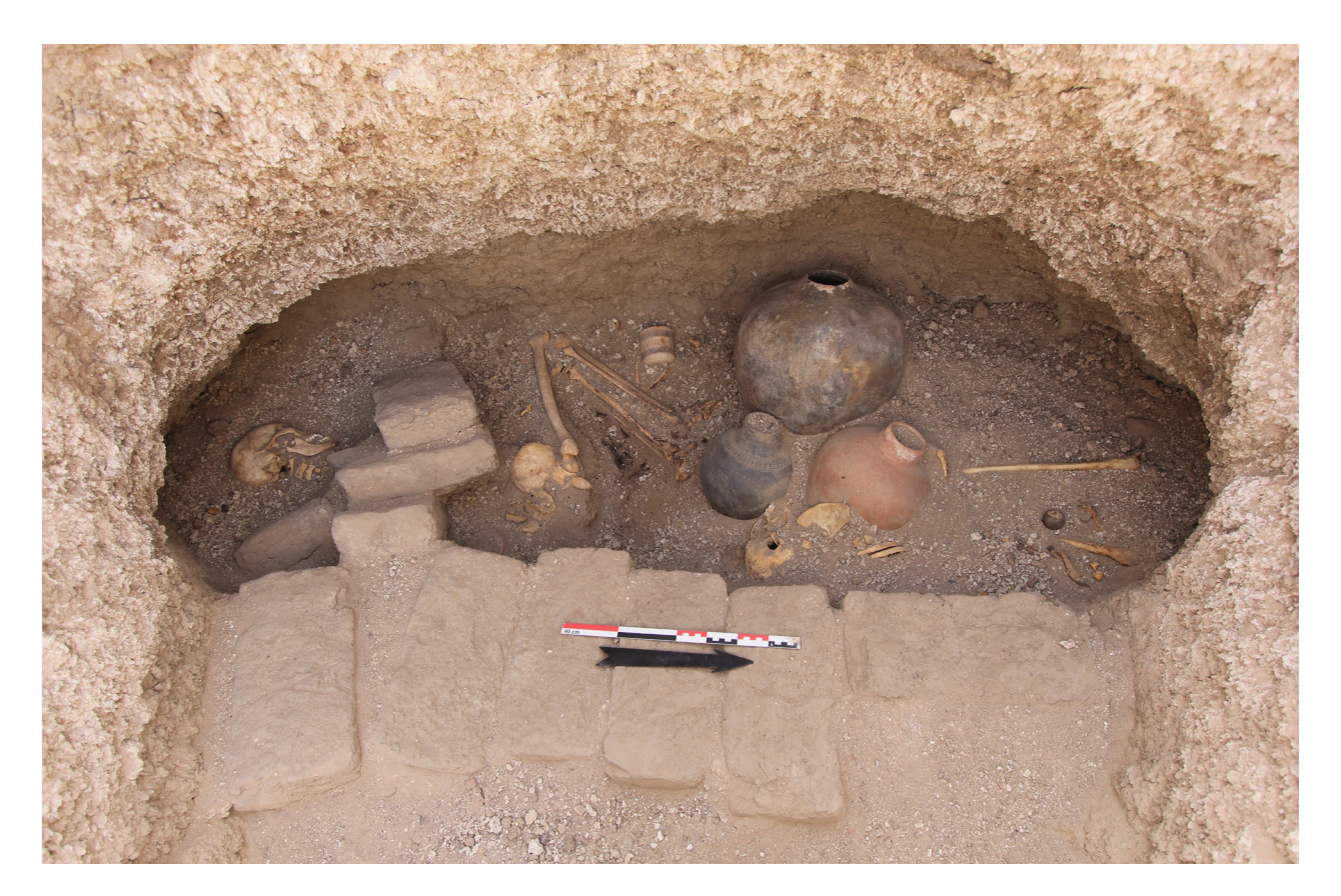
Figure 6. Burial chamber in Tomb BMC 62 shows collapsed mud brick over skeleton.