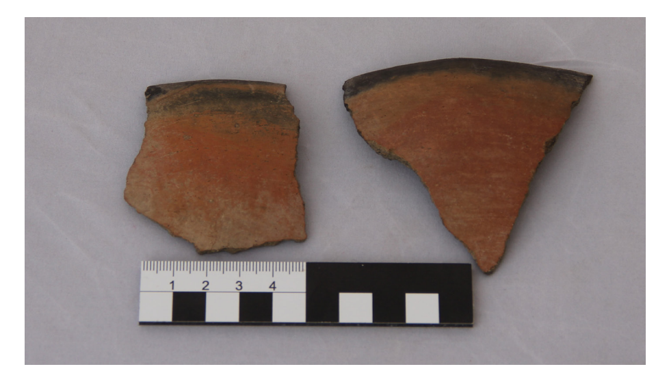
Figure 17. Kerma potsherds from Artoli.