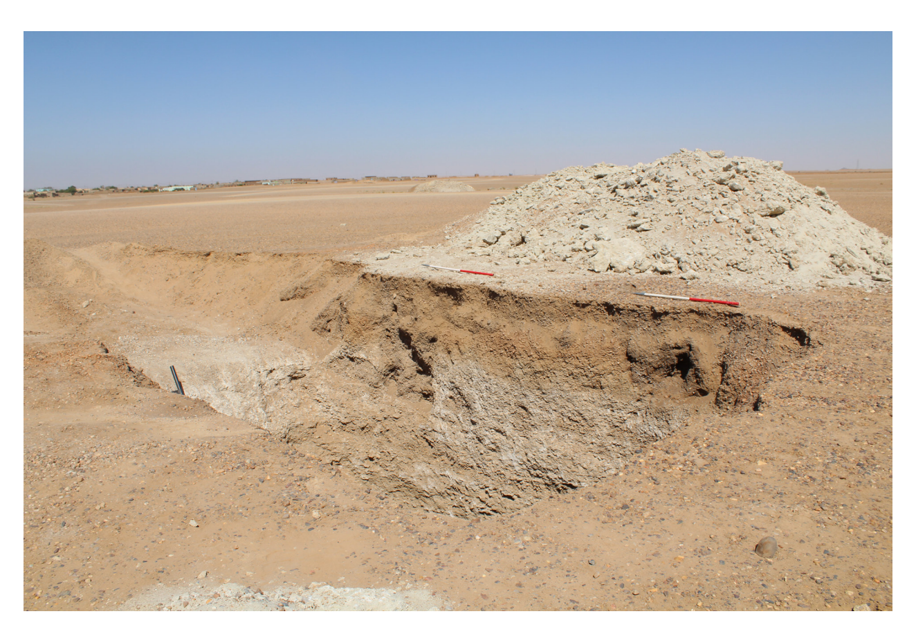
Figure 10. Tombs cut by well pit at Artoli.