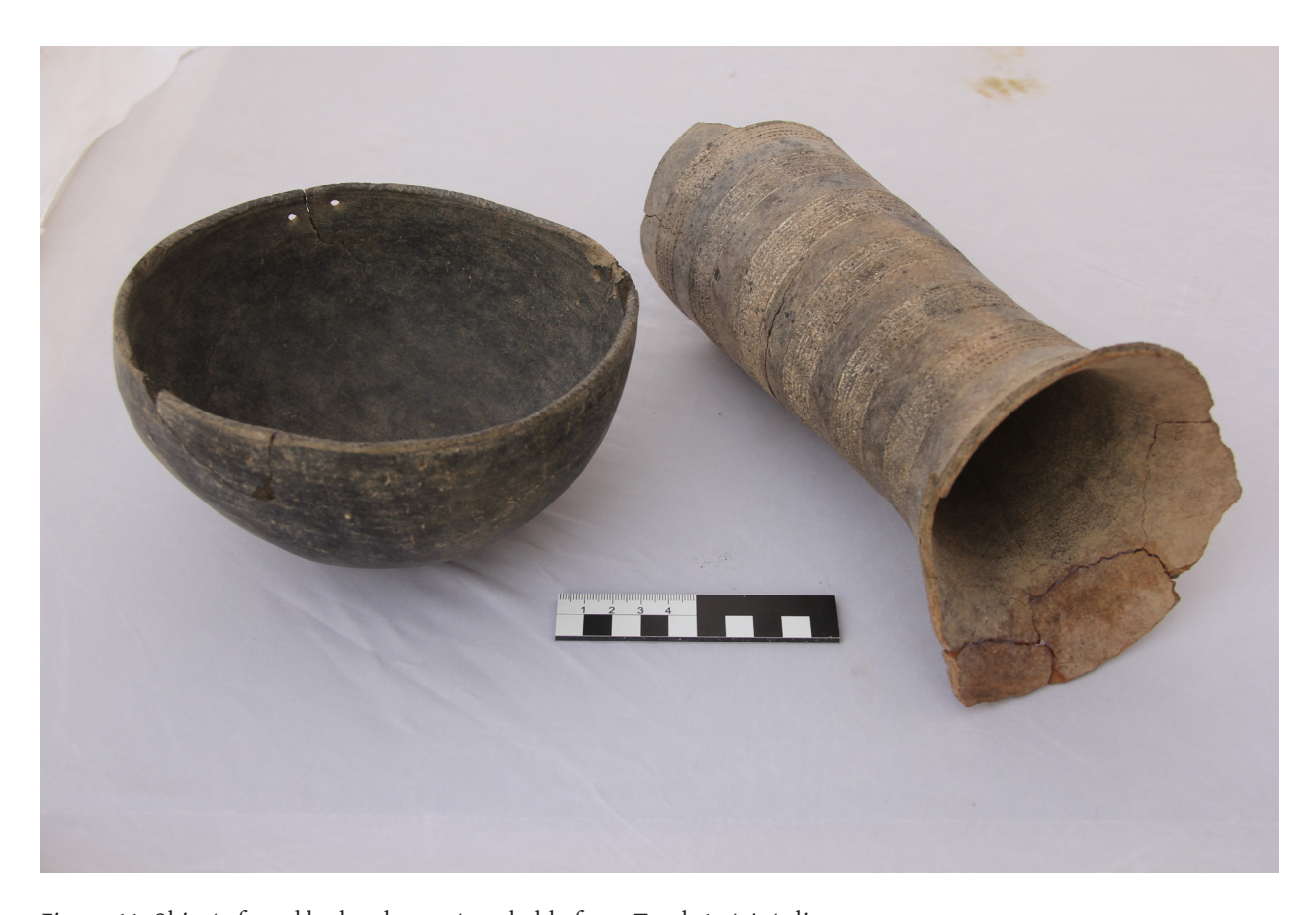
Figure 11. Objects found by locals, most probably from Tomb 1 at Artoli.