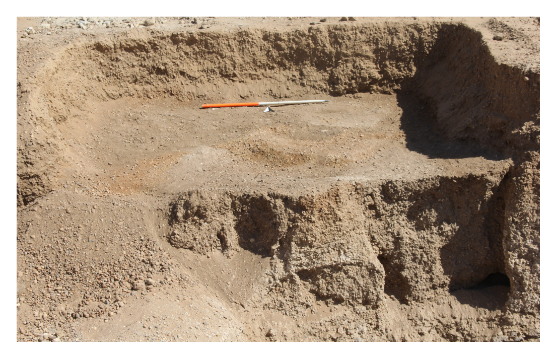
Figure 12. Inspecting the area looking for more tombs at Artoli.