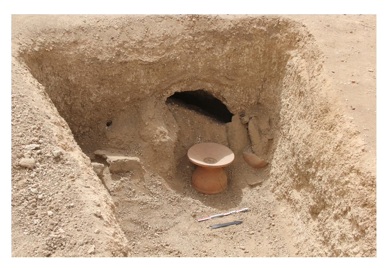
Figure 7. Possible pottery stand in BMC 63.