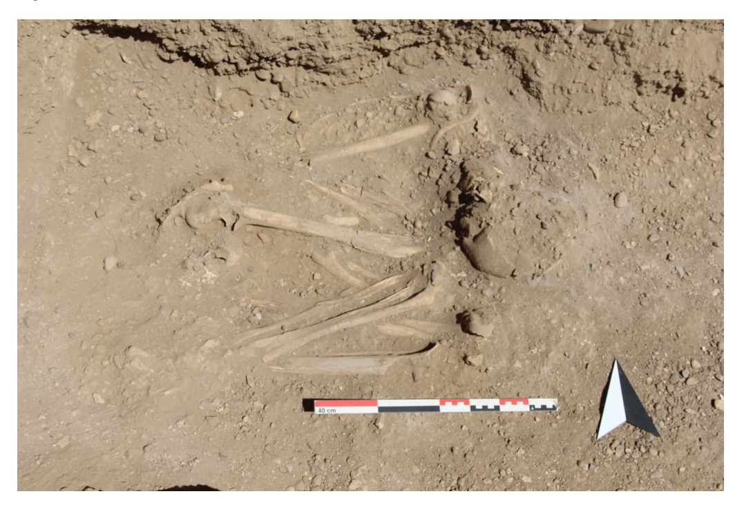
Figure 14. Upper burial in Tomb 5 at Artoli.