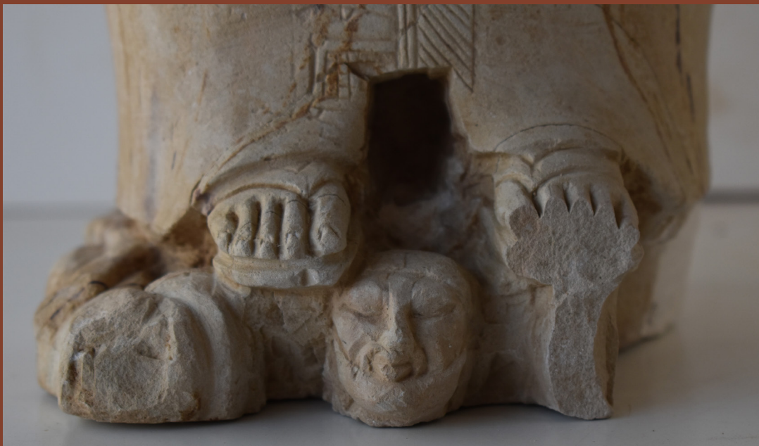
Detail of the statue of the deified queen at Wad Ben Naga (photograph by Pavel Onderka).