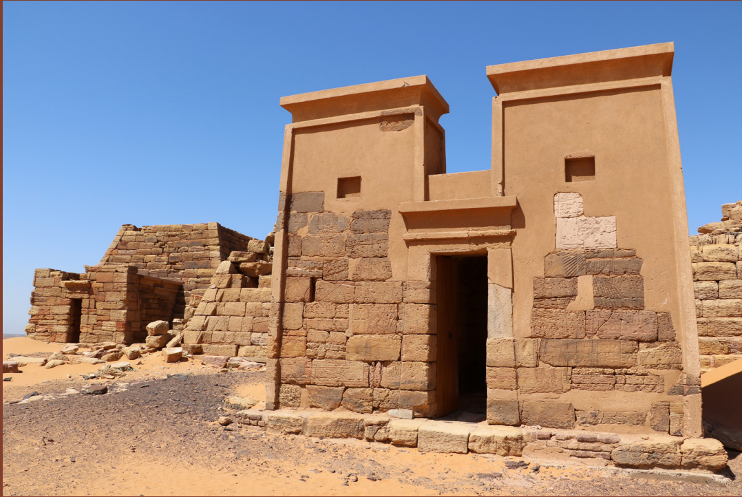
Pyramid Beg N. 6 in its present state including restoration of the pylon.